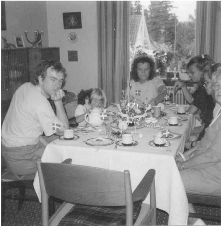
Figure 2 ... Yet more flags.